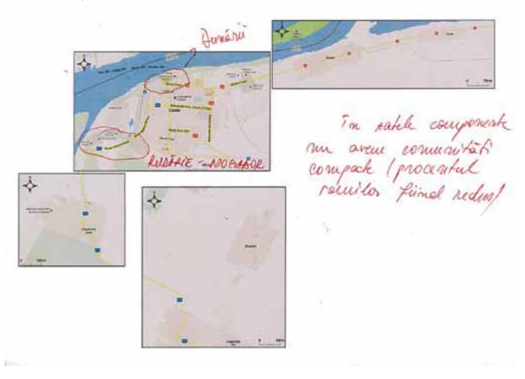
Map 2. Calafat socio-map (red areas marked as zones inhabited by 'compact Roma communities')